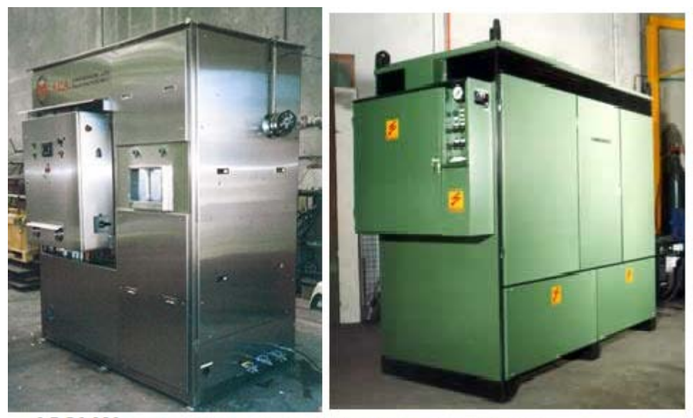
120kW Electric Steam Generator & Superheater 300°C

Steam Demand Growth can be met by adding additional generators to operate either in parallel or adjacent to individual process operations. This is a great energy saver and also reduces cost of your production. Generators do not require a boiler room or special foundations or local authorities' approvals, it can be installed anywhere adjacent to users of steam, so it produces a saving on pipe installation work, materials, maintenance. An induction steam generator as show bellow.